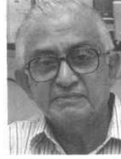
Hosbet Suresh retired judge, Bombay High Court

up cases where members of the judiciary are facing some kind of corruption charges."