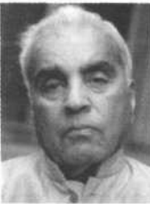
Rajindar Sachar former judge, Delhi High Court