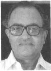
P.B. Sawant former judge, Supreme Court of India

"Media can always report these issues, highlighting the charge without commenting on it. There is an urgent need for some mechanism that will take