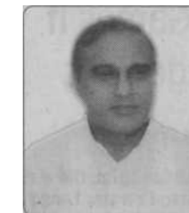
Shri Chandra Sekhar Sahu Minister of State for Rural Development

For the protection of land owners' interest "National Rehabilitation & Resettlement Policy, 2007" has been implemented throughout the country from 31 st October, 2007