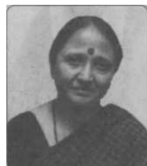
Smt. Suryaakanta J. Patil Minister of State for Rural Development