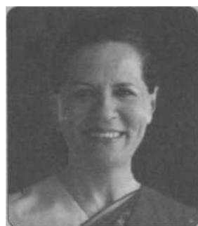
Smt. Sonia Gandhi Chairperson, UPA