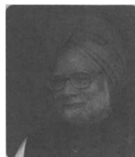
Dr. Manmohan Singh Hon'ble Prime Minister