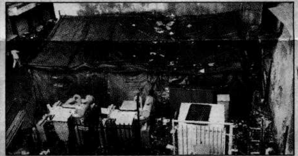
ANOTHER THAT FELL: This is what's left of Rassiwala Building