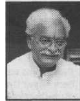
Shri A. Narendra Union Minister of State for Rural Development