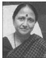
Smt. Suryakanta Patil Union Minister of State for Rural Development