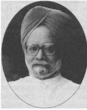
Dr. Manmohan Singh Prime Minister of India