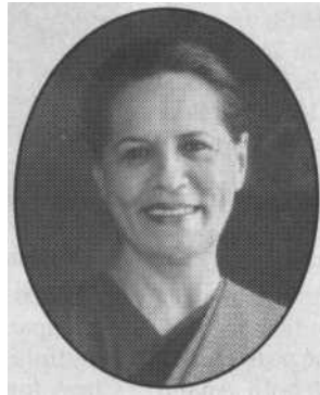
Smt. Sonia Gandhi Chairperson National Advisory Council