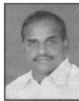
Dr. Y.S. Rajasekhara Reddy, Chief Minister of Andhra Pradesh